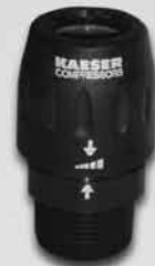
Male threaded connector, NPT Thread Series AN6605