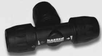
Equal tee connector Series AN6604