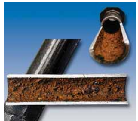
This actual cutaway of black iron compressed air piping shows typical contaminant build up and flow restriction after just a few years of operation.