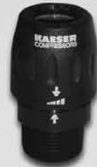
Male threaded connector, NPT Thread Series AN6605