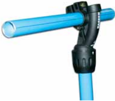
Integral condensate retention design for superior flow without pressure drops.

SmartPipe's smooth calibrated aluminum construction has a low friction coefficient, providing the best possible laminar flow. Full bore fittings further minimize pressure drop for optimum flow and energy efficiency. Leak free connectors prevent air loss and wasted energy.