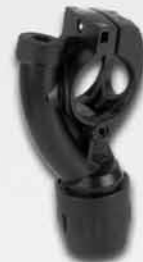
Quick assembly bracket Series AN6662