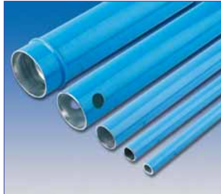
Rigid aluminum calibrated pipe assures clean air and optimum flow rate performance.

The SmartPipe™ line includes all the accessories you need for a top quality installation: