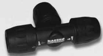
Equal tee connector Series AN6604