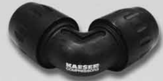
Equal elbow connector Series AN6602